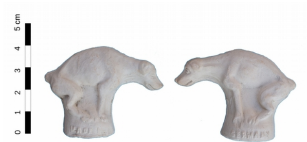
(c) Jan van Oostveen ( http://kleipijp.home.xs4all.nl ) Details are not to scale